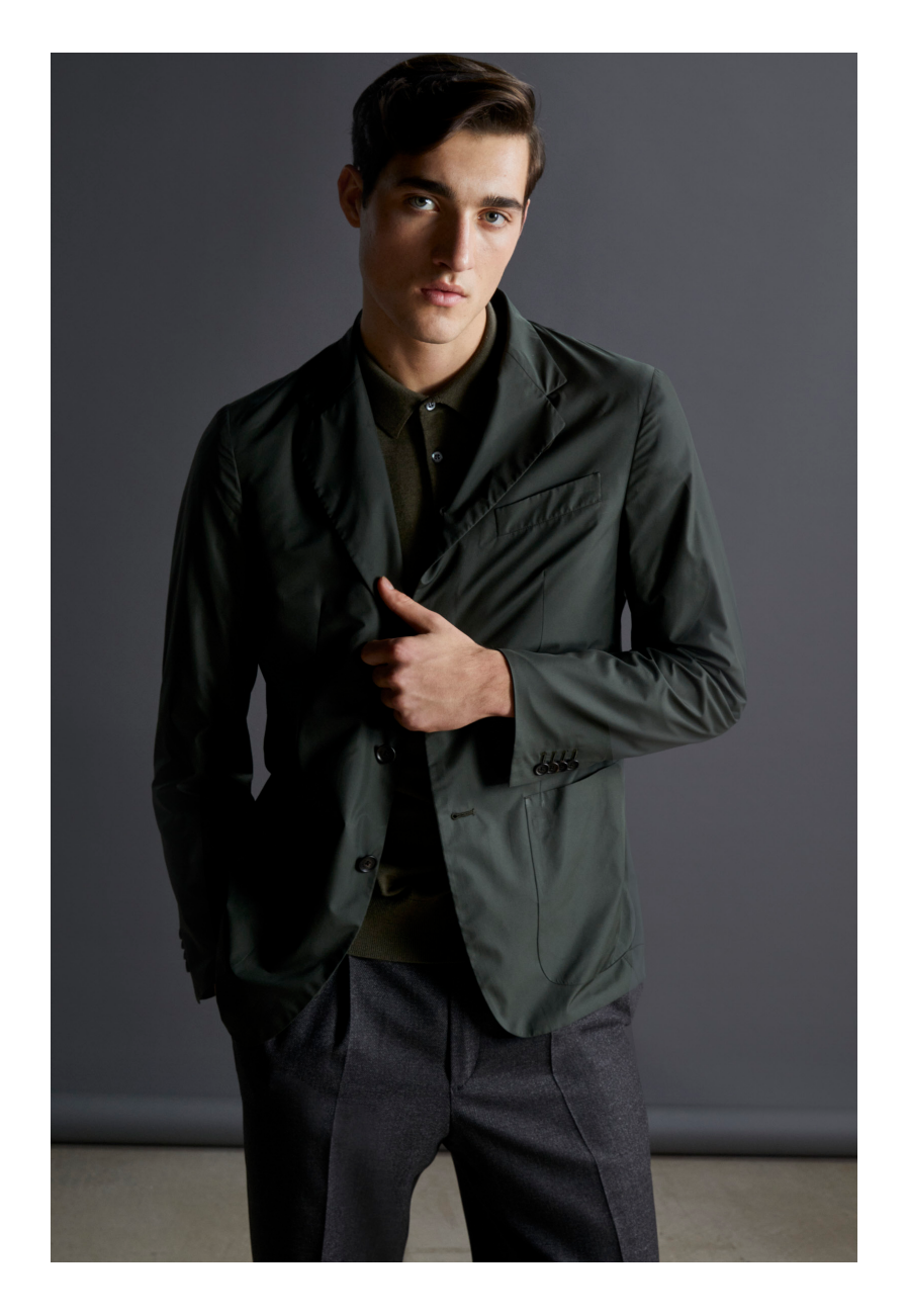
Look17 Traviata blazer realized in nylon with woolen lining.