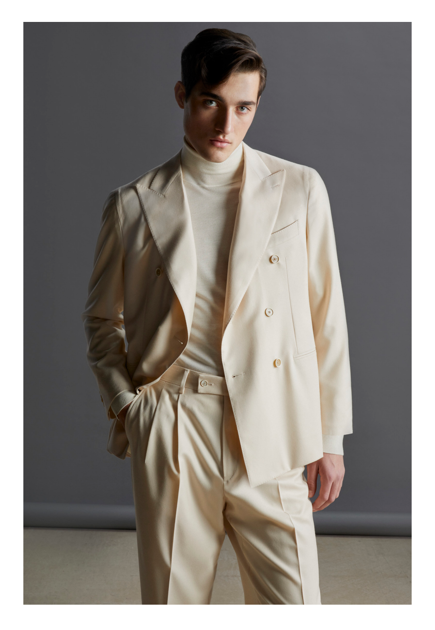
Look6 – Look7 Both looks are combined with double breasted worn with a turtle neck, for an hedgy and chic appearance. A Norma blazer realized in silk with a washed optical and an Aida blazer combined with a sporty pant.