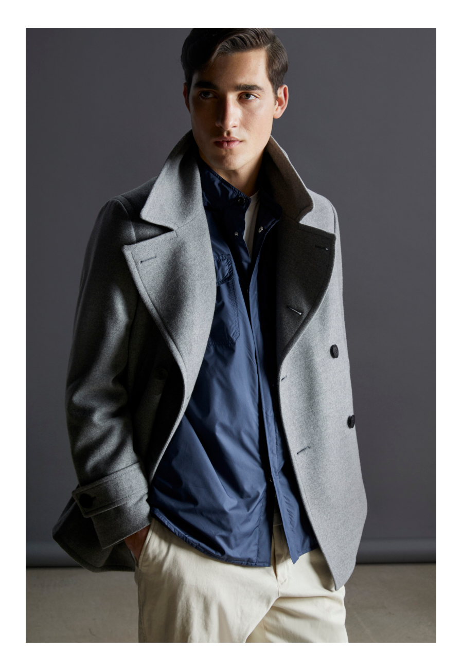
Look 20-Look 21 Two different grey tones blended with the seasonal dusty blue: casual Nabucco blazer and a woolen peacot to embellish the outfits.