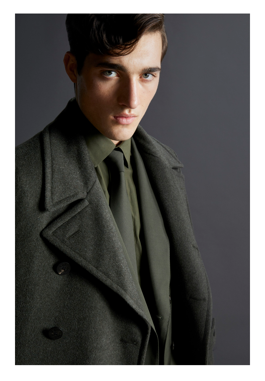
Look16 Total green: Military chic.