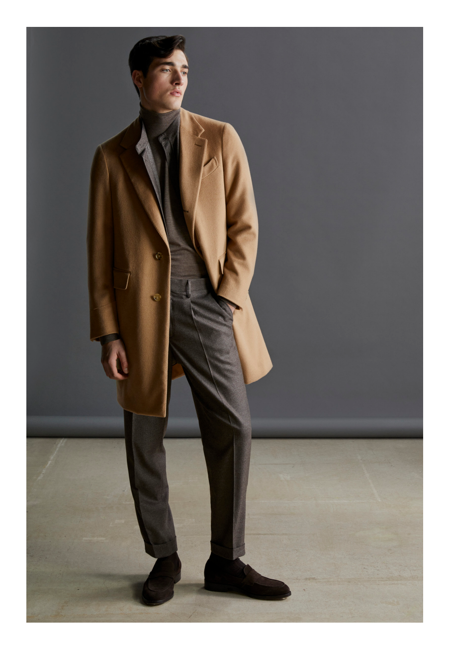
Look9 Our classic Aida camel coat, worn for more relaxed occasions with an overshirt and a chino realized in our Nuage wool.