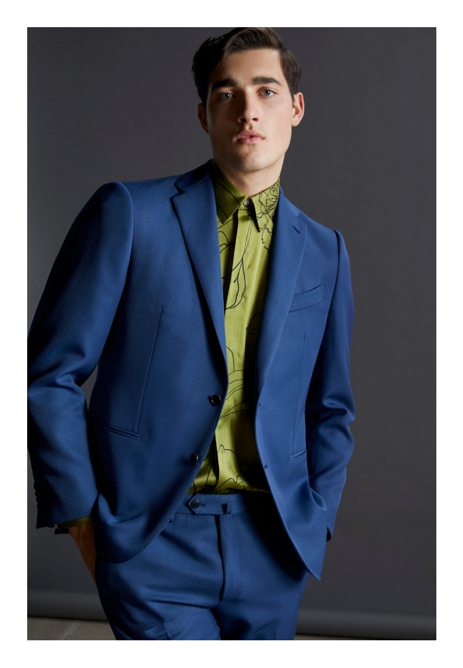
Look19 Dusty blue woolen coat and Dusty Blue Norma suit, worn with Olive Silk Shirt with exclusive seasonal flower print.