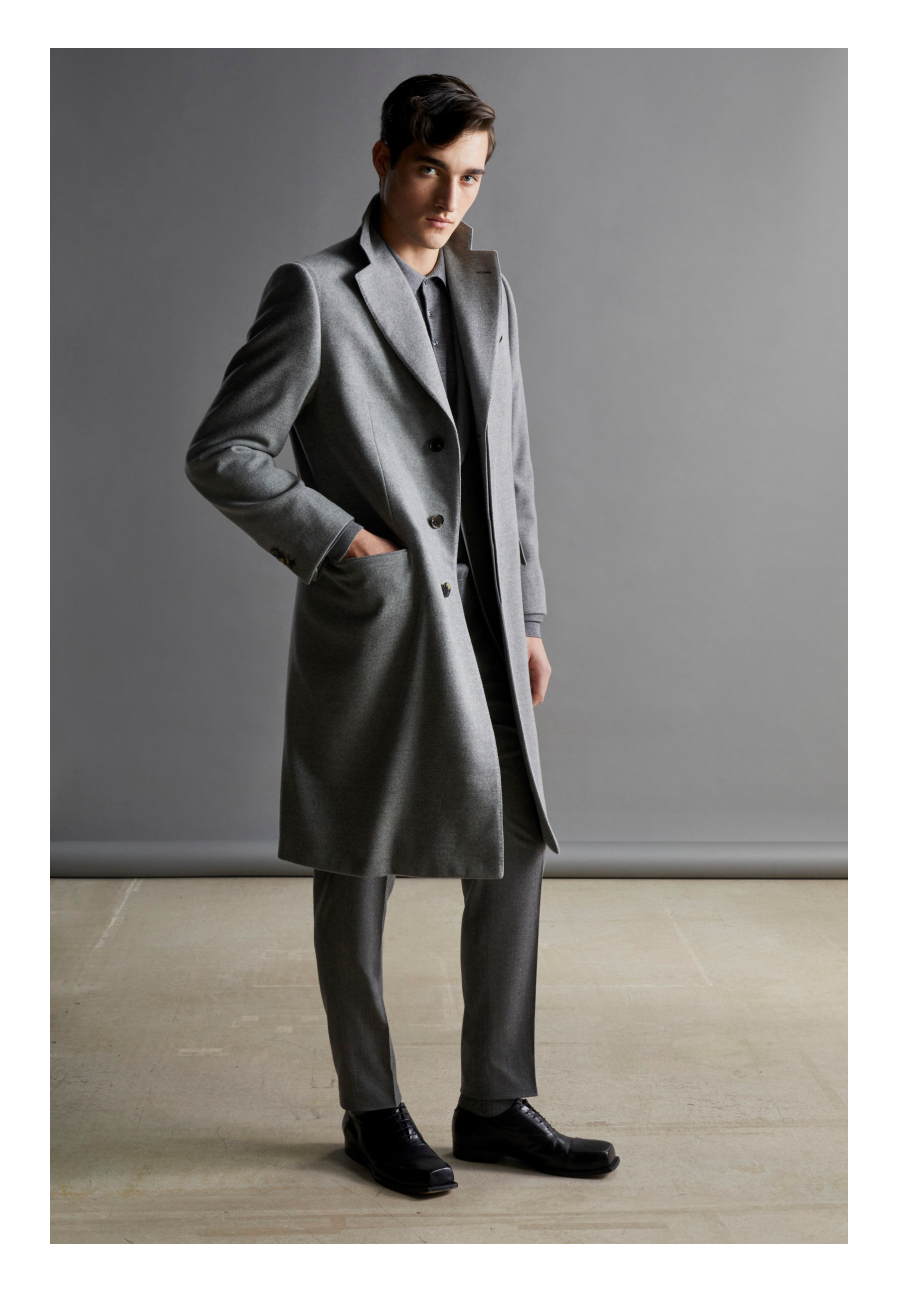
Look1 A minimal chic look made from luxurious flannel, with a romantic touch.