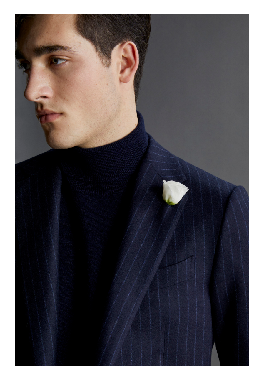
Look22 Fashion uniforms Daylight: a double breated Norma coat with a navy pinstripe suit.