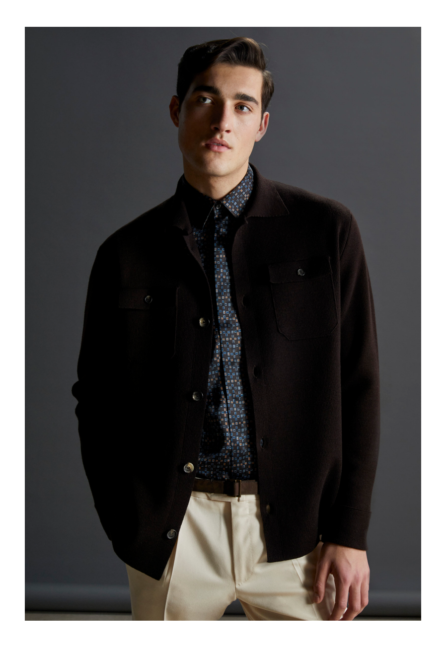
Look 11-Look 12 The novelty of this is season is our new knitwear program, with looks created to blend in these products in formal and less formal outfits.