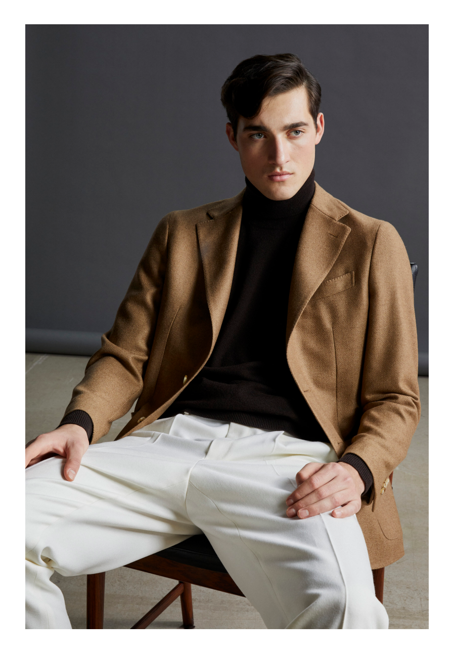
Look10 Our Zero coat revisited with a relaxed feel: realized with a doubled neoprene material, with a modern and urban silhouette. In the picture on the right our Butterfly blazer realized with Gold fabric.