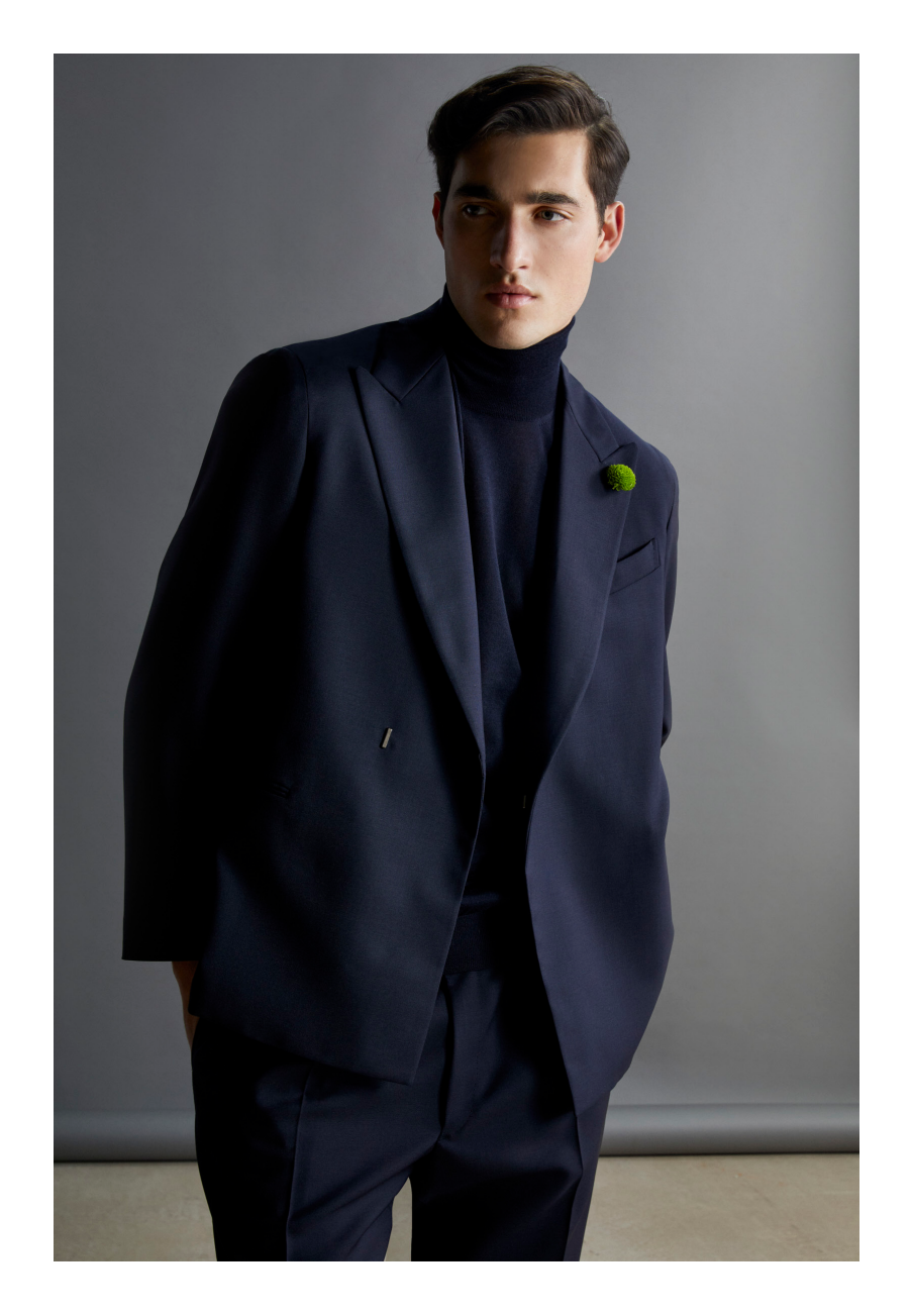
Look23 - Look24 Fashion uniforms Evening: two tuxedos worn with tonal shirt and knitwear.