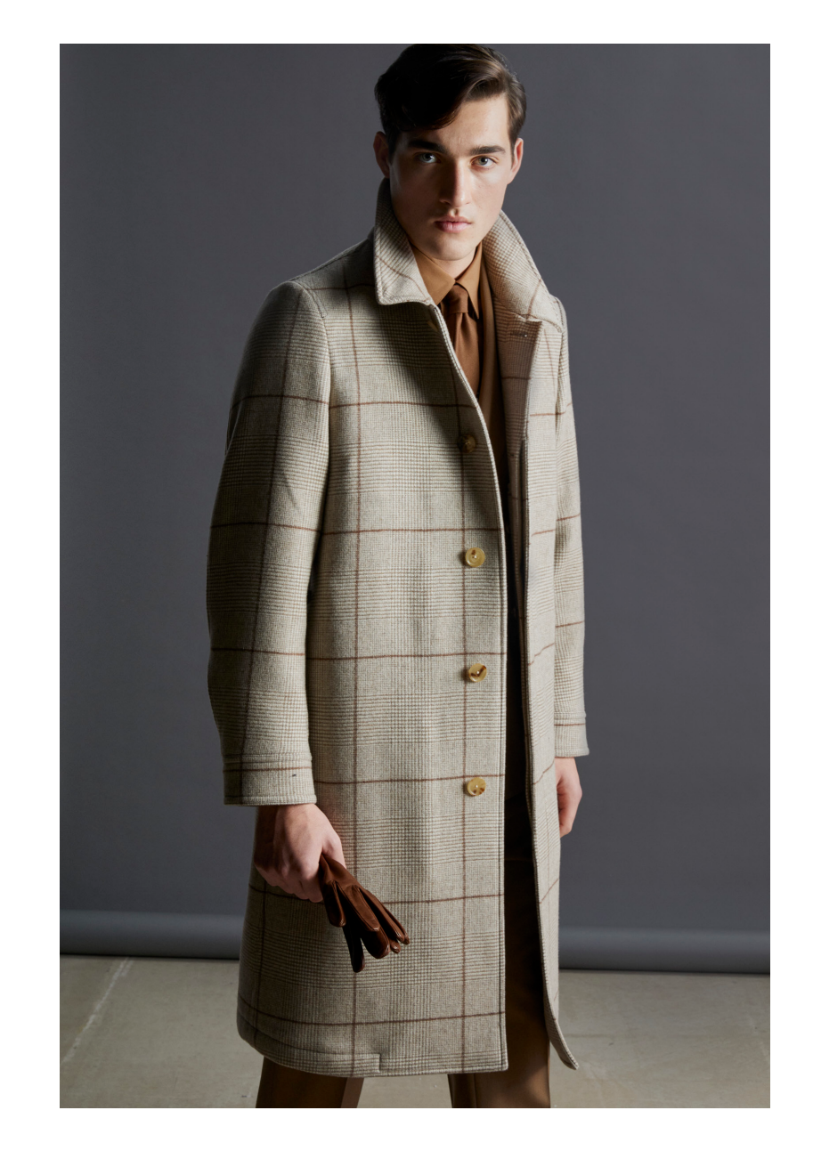
Look8 A total camel look realized with the Aida double breasted, worn also with our macrocheck tonal overcoat.