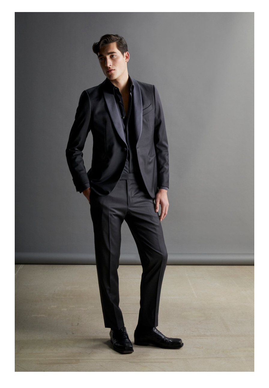
Look_4-Look_5\\ Both grey looks conceived for special occasions: chintz grey wool for one outift and a classic tuxedo for the second one.