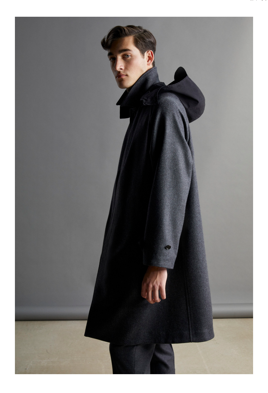
Look3 How to disrupt a velvet tuxedo worn with a turtle neck. In the other picture our iconic Zero coat in wool with removable hoodie for the rainy days.