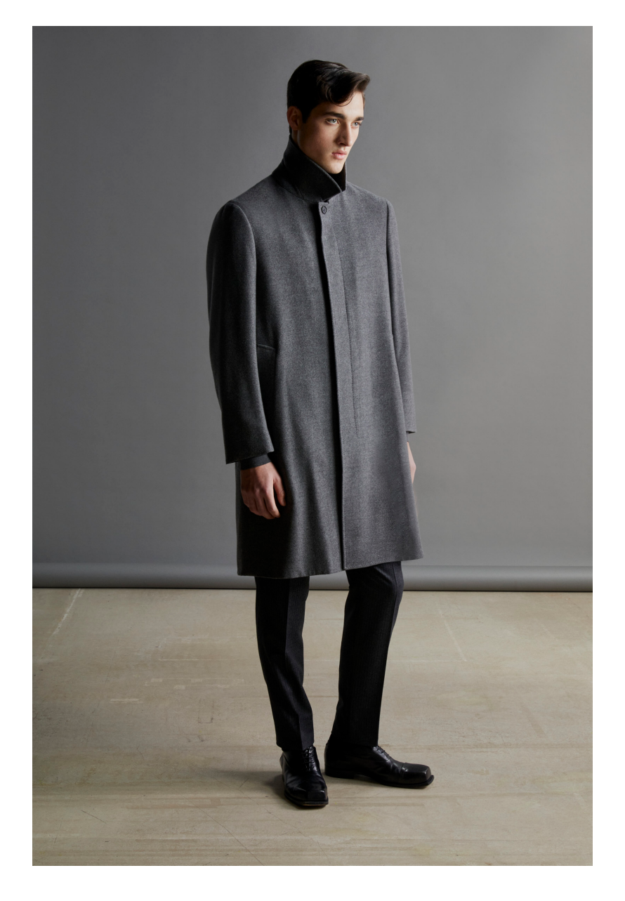
Look2 Norma pinstripe suit worn with a turtle neck and a Traviata coat.