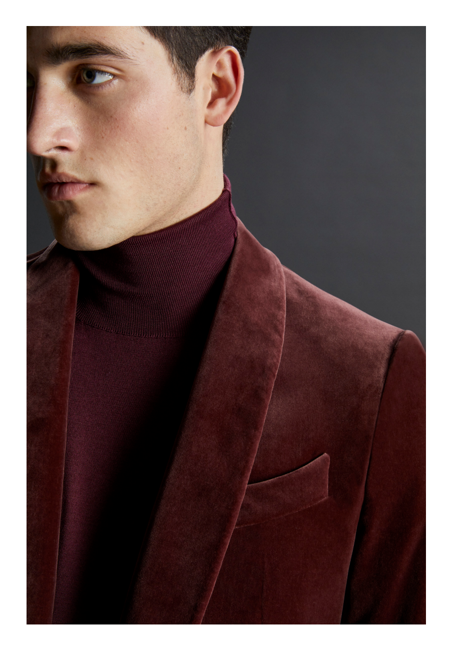
Look13 Velvet tuxedo stands for Modern elegance.