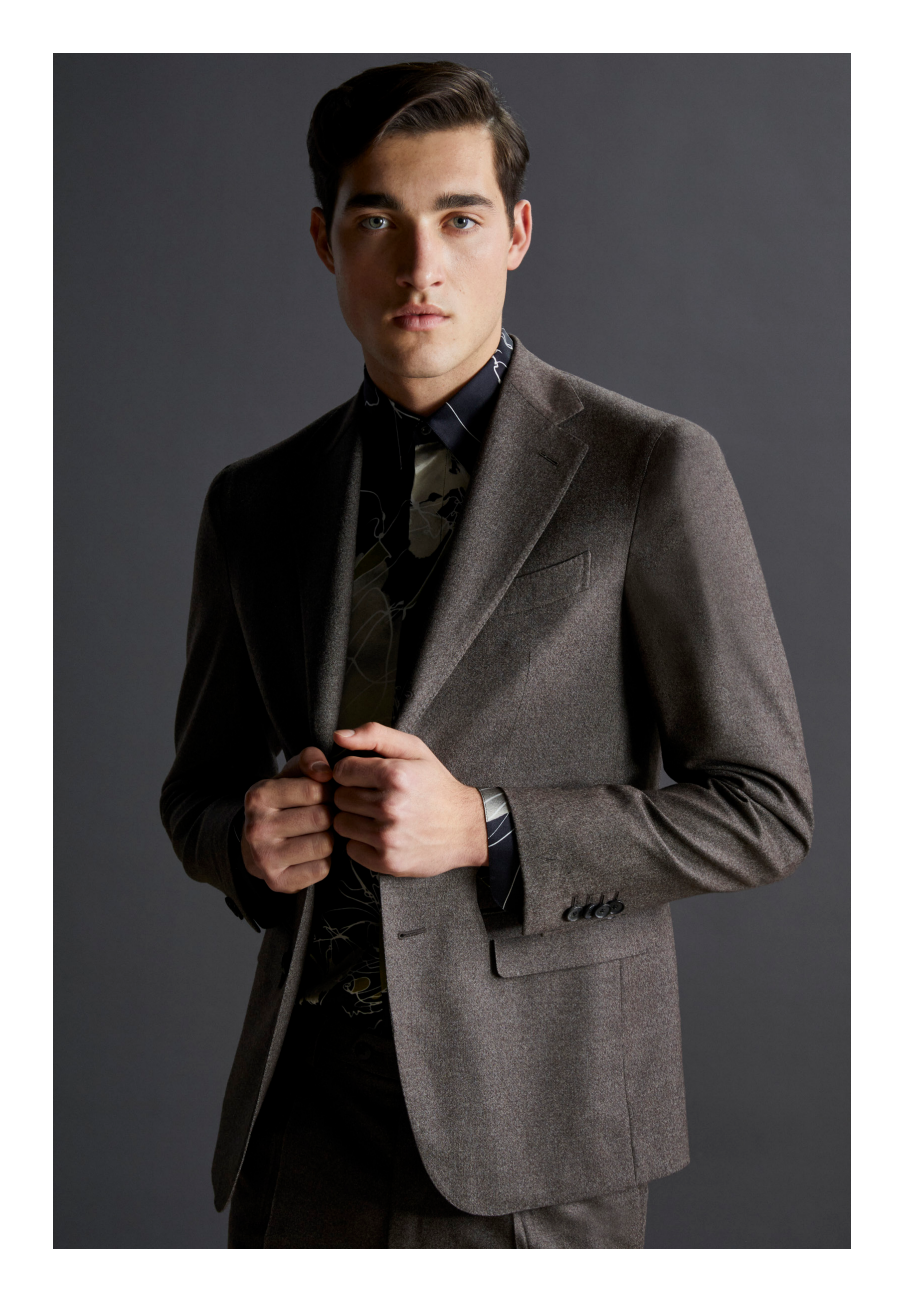
Look15 The Aida suit worn with a silk shirt realized with an exclusive flower design, for a Neo romantic outfit.