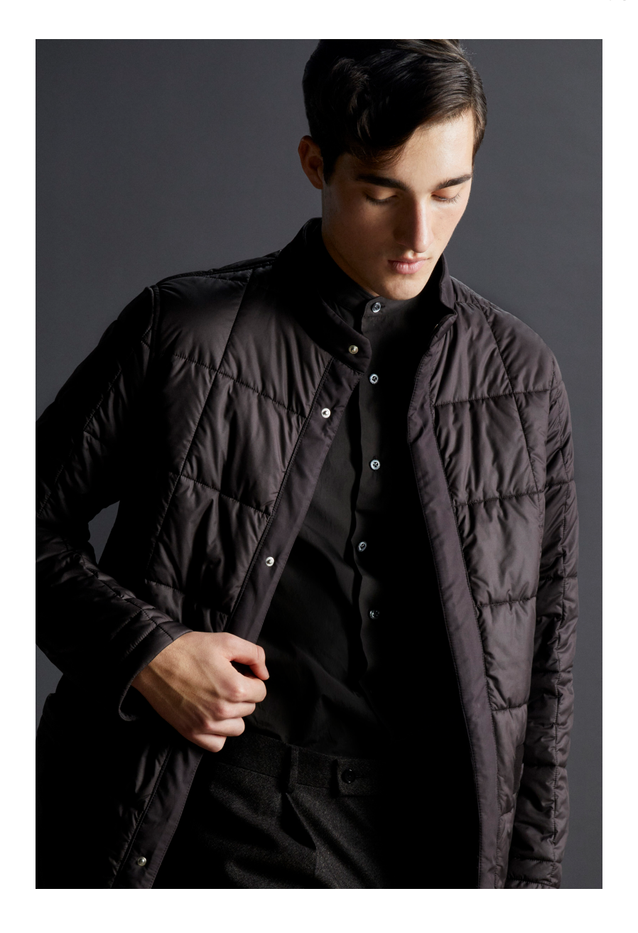
Look14 Total brown: the Otello coat with a sartorial aspect mixed a quilted car coat and a dad collar shirt, worn with our regular pant in technical fabric. Sartorial meets functional.